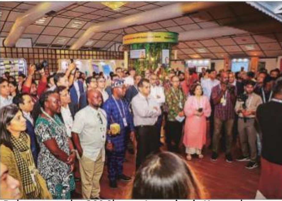
Delegates at the G20 Sherpas' meeting in Kumarakom, Kerala, on Thursday